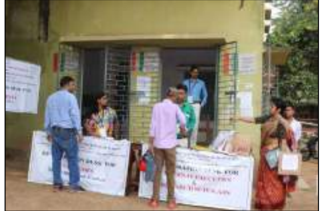
Registration of delegates for Seminar by the faculty members of the College