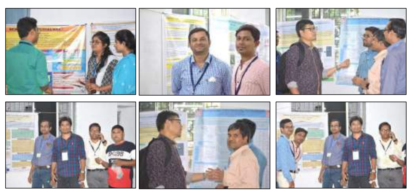
Poster presentation by Faculty members of Suri Vidyasagar College