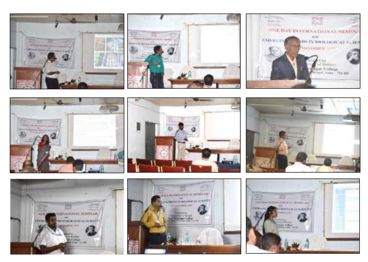
Oral Presentations by Delegates from different Colleges and Universities