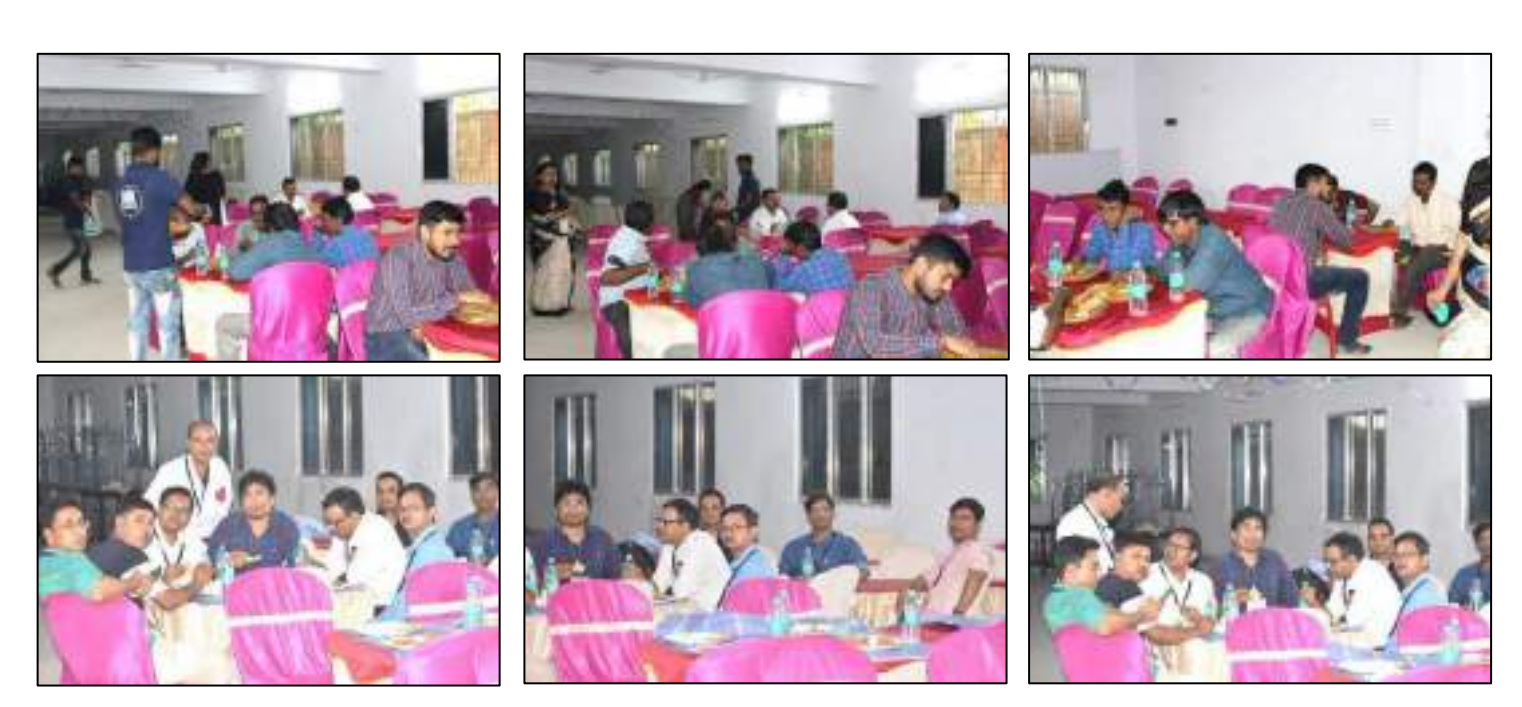
People enjoying by delicious food items in Tiffin and Lunch session