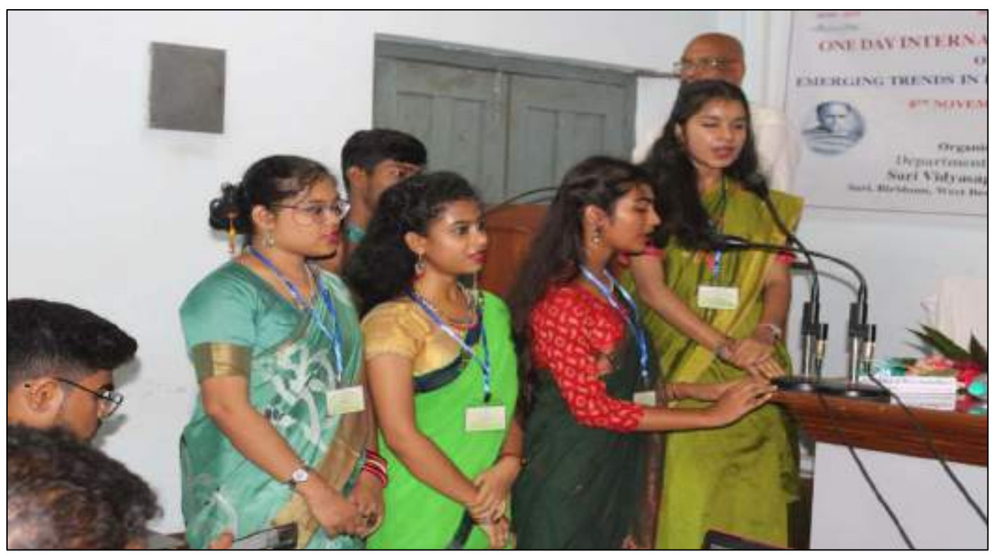
Inaugural Song performed by the Students of Botany Honours