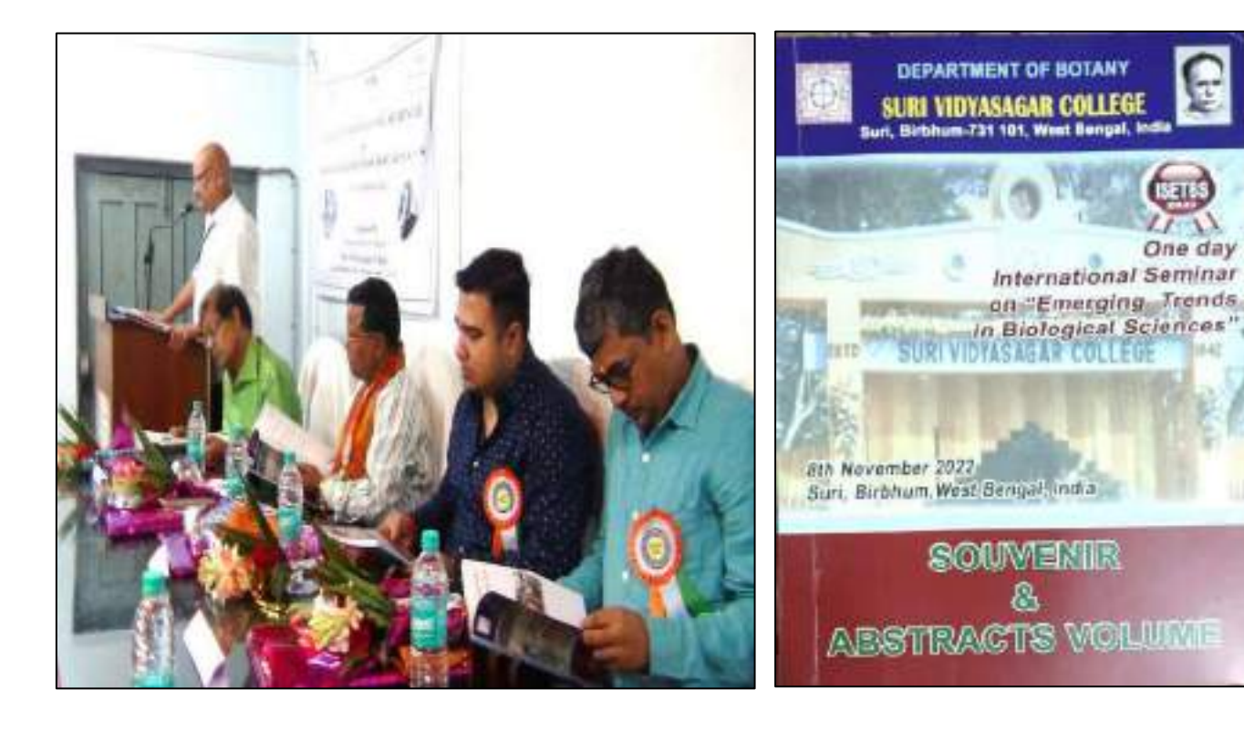
Publication of Abstracts Volume of ISETBS-2022 by distinguished resource persons