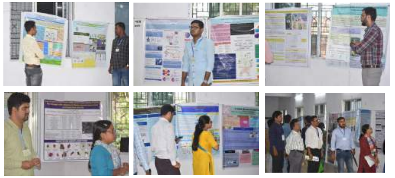
Poster presentation by Delegates from different Colleges and Universities and observed by organizing committee along with Principal of Suri Vidyasagar College