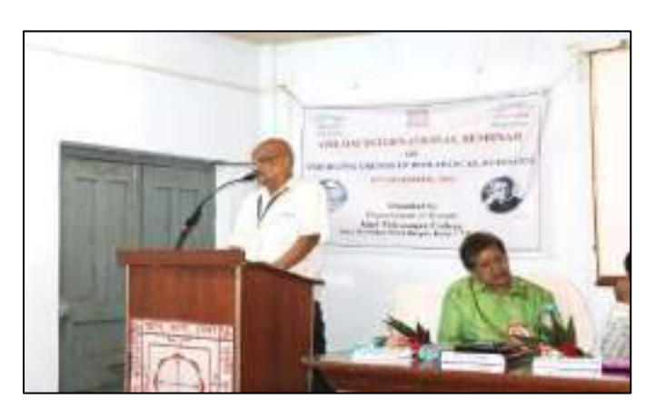
Speech by Convenor of Seminar