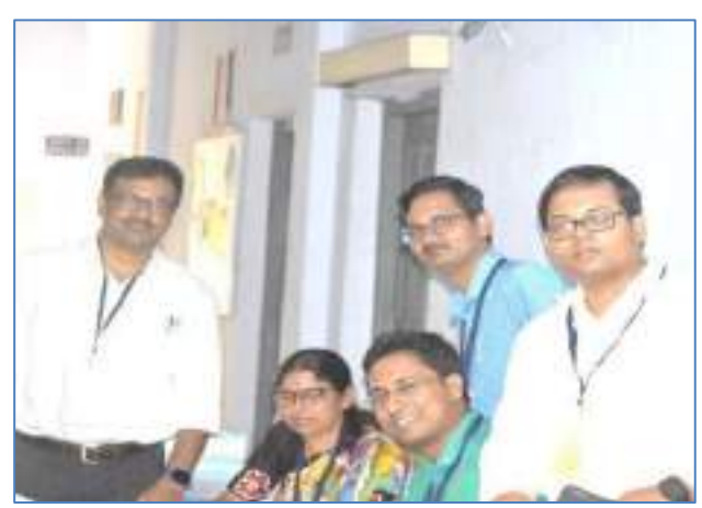
Active organizing committee of ISETBS-2022