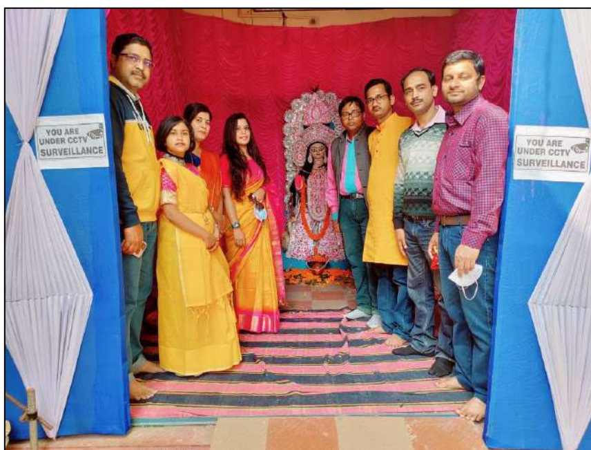
Actively participating Students with Teachers