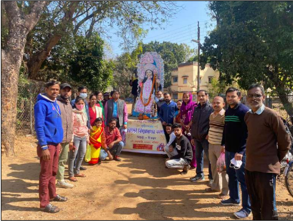
Before Procession of Pratima for Niranjan