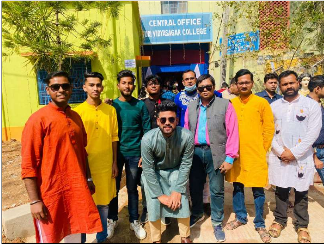
Enjoyment of students and Teachers After Puspanjali