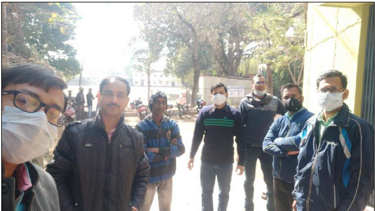
Teachers of this college adopting precaution against Covid as per as possible