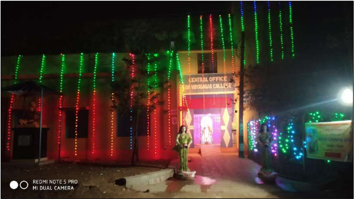
Lightening of campus by LED lamp in Saraswati puja eve