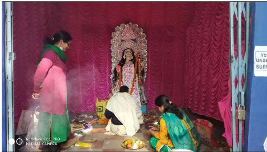
During Puja by Purohit