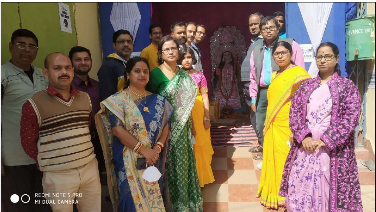
Active Committee members with Convenor of Social and cultural committee of this College