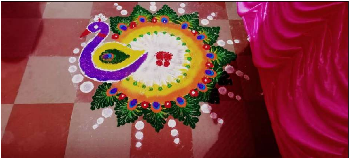
Rangoli drawn by the students of Suri Vidyasagar College