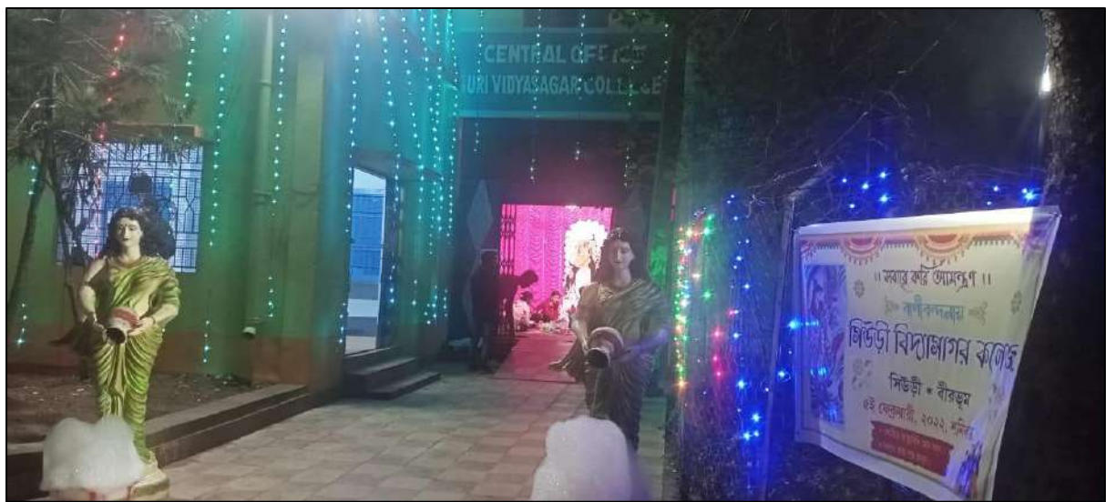
Awareness poster against Covid beside the pandel for taking better precaution