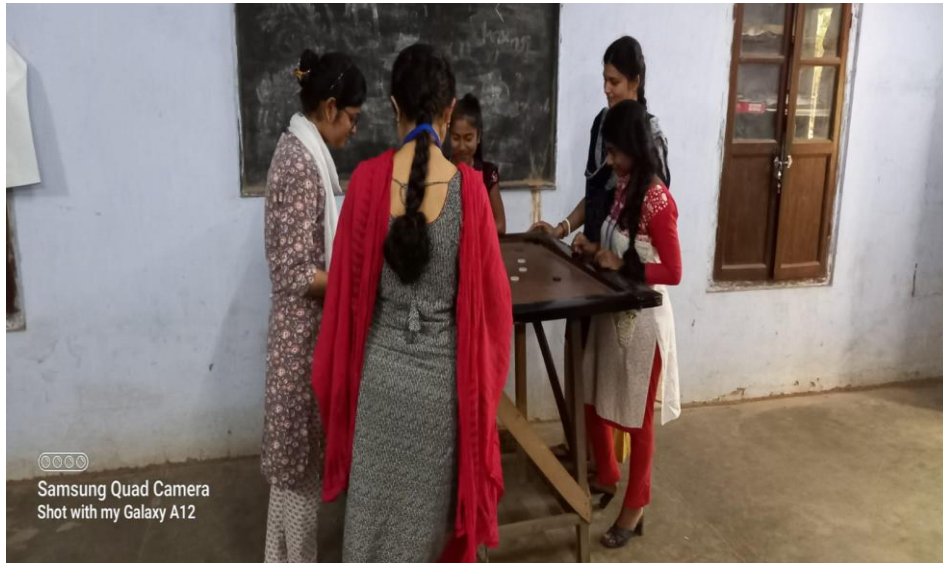
Carom for Girls' students