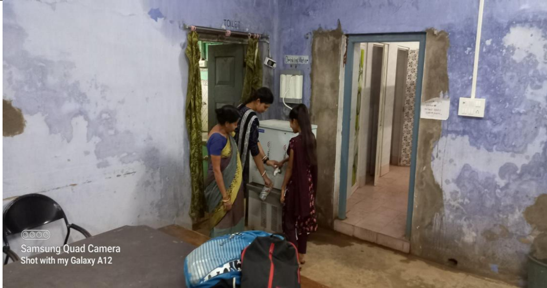
AMC maintained water purifier

Website : surividyasagarcollege.org.in , e-mail : surividyasagarcollege1942@gmail.com