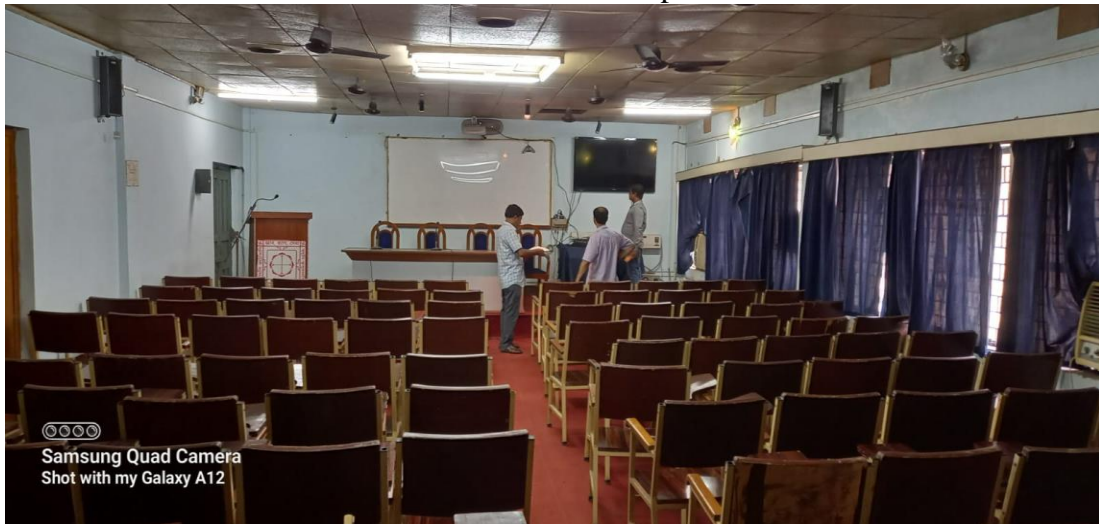
Well maintained Seminar Hall